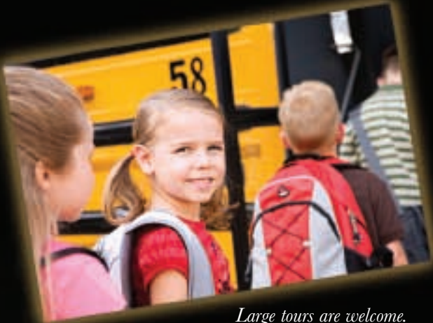
Large tours are welcome. Large picnic area is available.

A different experience every time you visit